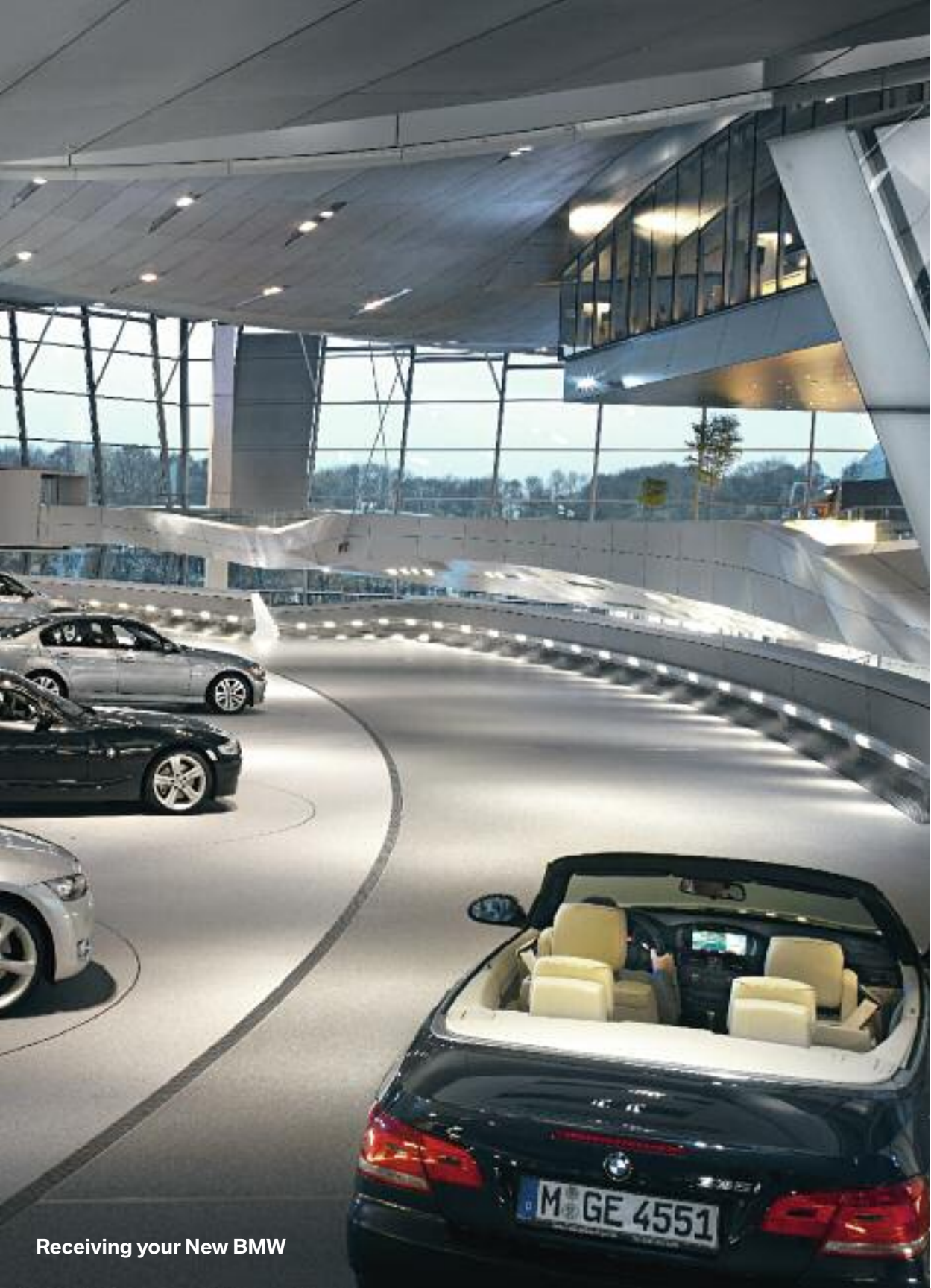
Receiving your New BMW